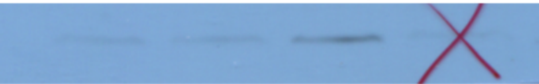
Figure 6 panel L